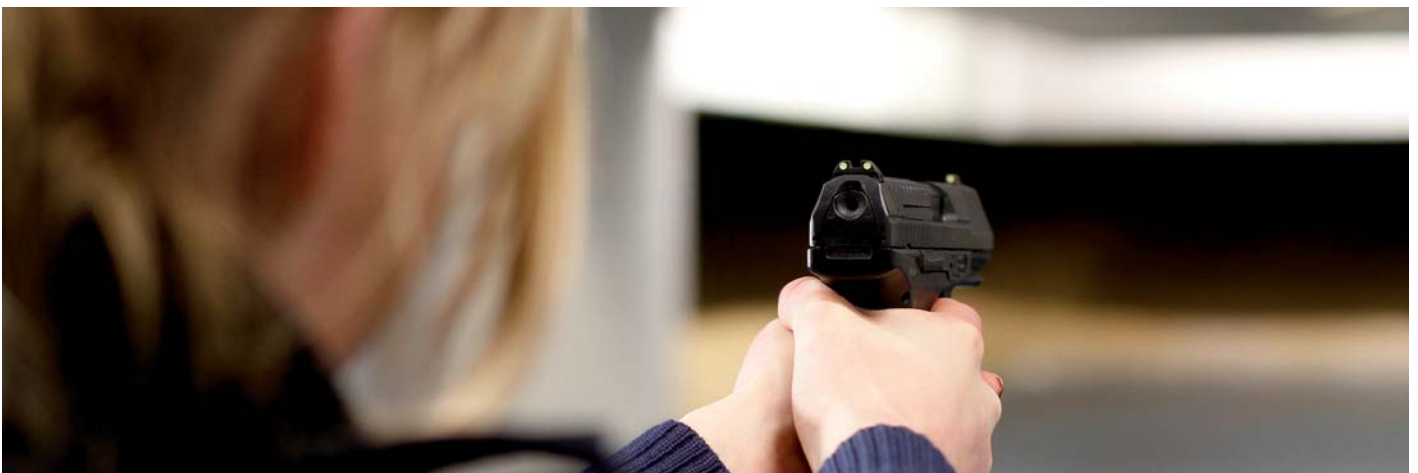
Figure 2: Target practice in the indoor shooting range

Strulik displacement ventilation systems for indoor shooting ranges and/or partially covered installations are individually designed and optimised to meet all the requirements for a specific project.