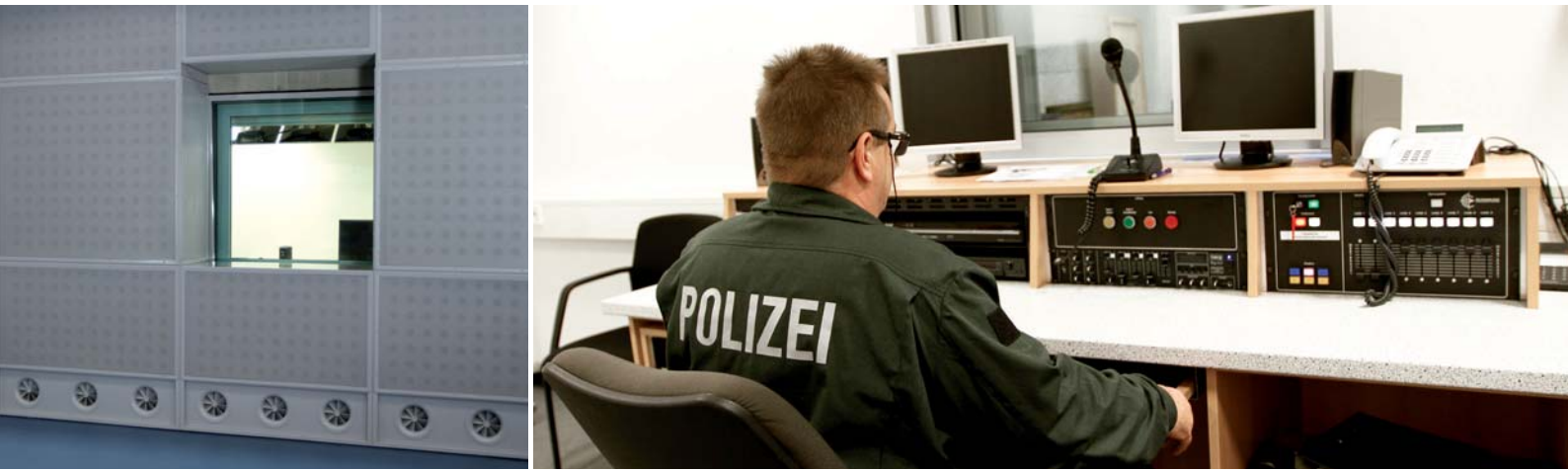
Figure 1: Indoor shooting range – Düsseldorf police force