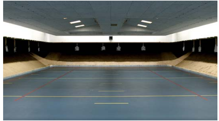
Figure 3: 180 degree shooting range

During exercises beginning at the 3.6 m firing zone at the end of the range, the shooters move backwards in the direction of the air diffuser elements and therefore against the airflow. This ensures that, even for fast movements, all the personnel in the shooting range are always located in an unpolluted