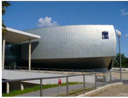
Concert Hall Music Academy in Kalisz