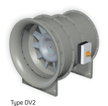
Туре DV2 Installation sizes 400 mm to 1,120 mm 0.75 to 45 kW Power range Repair switch, air-intake nozzle, Accessories, standard extension shaft, shaft feet Flexible connectors, counterflanges, protection grille, Accessories, optional diffuser, spring vibration damper, vertical brackets Axial fan with characteristic curve stabiliser, Short text impeller with adjustable blade and adjustable guide wheel Colour RAL 7030